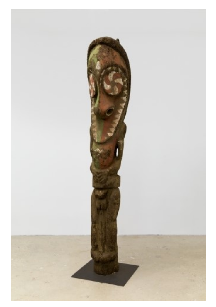
Grade Society Figure, Ambrym Island

The Vanuatu figures on view hail exclusively from the collection of Wayne Heathcote, a leading collector and dealer of Oceanic art. Heathcote acquired the collection in the early 1970s, through Nicolai Michoutouchkine, founder of the Museum of Oceanic Art in Port Vila, Vanuatu, after having served as a field policeman on the Sepik River in Papua New Guinea. The core of the group comprises two sets of towering fern figures, notable for their distinct stylistic differences. The larger group, featuring curvilinear forms and bright sections of hand-painted color, represents a formal approach unique to Ambrym, centrally located in the archipelago of Vanuatu. The second group, which features a more geometric approach to figuration, is unique to the Banks Islands, located at the northern end of the archipelago. A third group of smaller objects, typified by fully rendered figures over-modeled with a mixture of earth and vegetable matter, represent figuration from Malekula, the archipelago's second largest island.