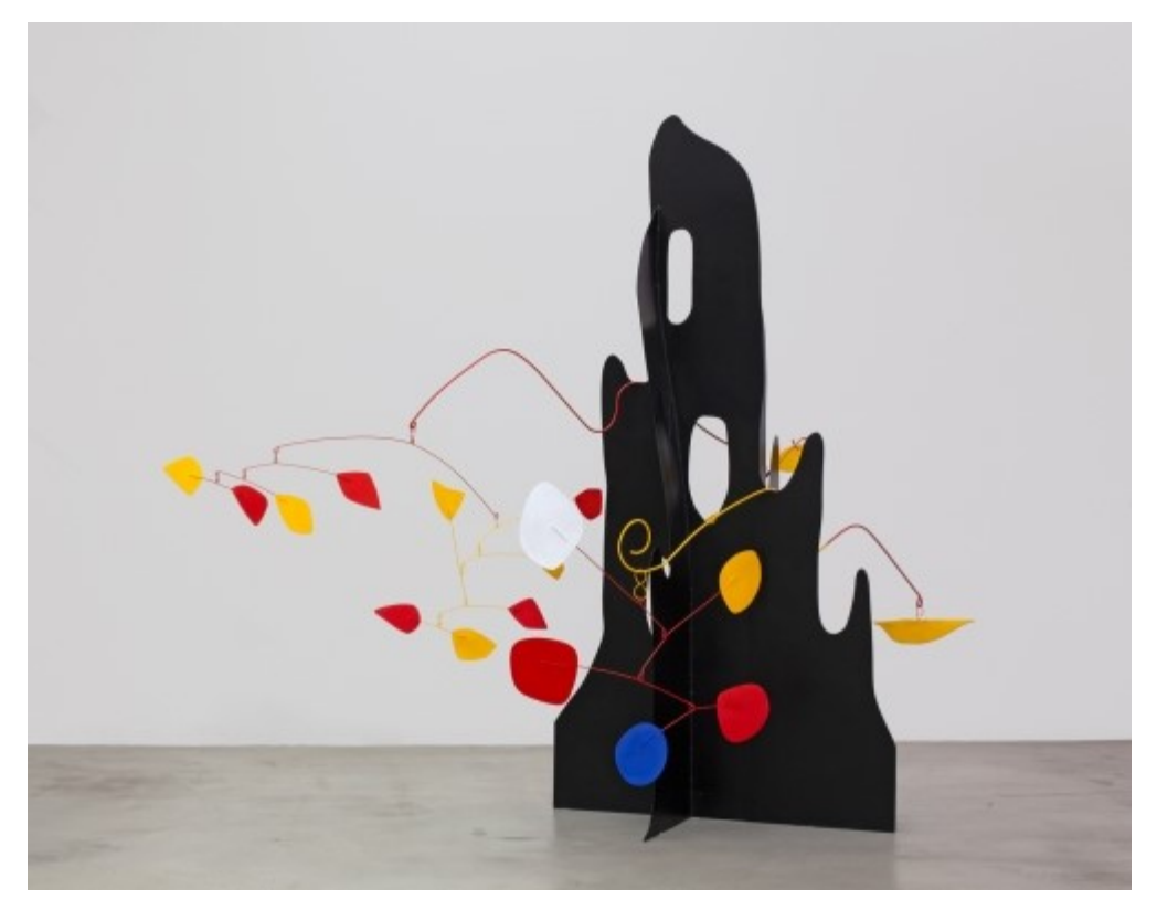
Alexander Calder, Crag, 1974, standing mobile – sheet metal, wire, paint

The circulation of ethnographic objects across Europe and North America impacted the international avant-garde, particularly the Surrealists, in various ways. Like Pablo Picasso, Henri Matisse, and Andre Breton, Calder collected and displayed African and Oceanic objects, and at certain points in his career, Calder's works hint at formal resemblance to a number of these objects. In his homes, Calder frequently displayed his own works alongside his collection of African and Oceanic objects. In the spirit of such juxtapositions, the exhibition will present a major group of over twenty Vanuatu figures, produced on the Ambrym, Banks, and Malekula Islands, alongside Calder's Crags.