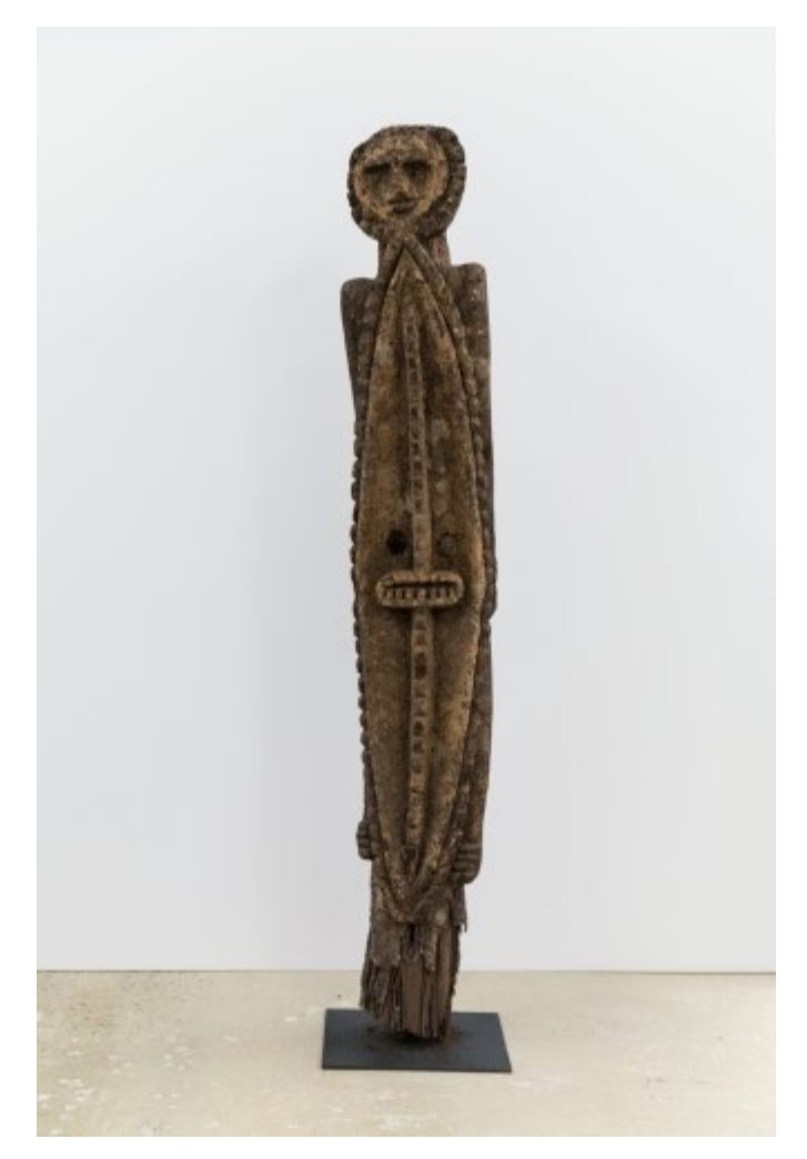
Banks Islands Suque Grade Society Figure

Though the individual characteristics of the communities that comprise Vanuatu vary significantly among its islands–some 100 languages are spoken among the nation's 250,000 inhabitants–the region is bound by a general social, political, and religious structure known as Kastom. The particularities of this cultural system vary between communities, but central to the societies on the Ambrym, Banks, and Malekula islands is the "Grade" system, a hierarchical structure through which members of the community advance their status. The three sets of figures, then, represent works commissioned by individuals as ritualized offerings that permit entry to successively higher grades. As Crispin Howarth notes in his book, Kastom: Art of Vanuatu , "[t]he commissioned sculpture is a form of public monument that, along with drumming, performance, and sacrificing pigs, signifies that an individual is taking a new grade." Carved from the fibrous trunk of the fern tree, these figures function as temporary homes for spirits associated with specific grades, and represent uniquely figurative approaches to sculptural form.